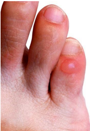
BLISTER ON FOOT