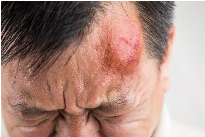
BUMP TO HEAD