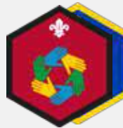
Beaver and Cub Teamwork Challenge Award