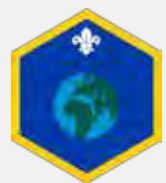
Cub Our World Challenge Award